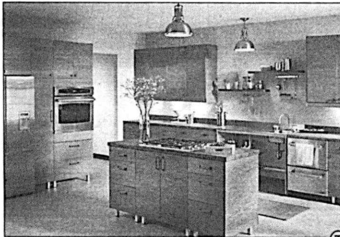
Hardware, including hinges, handles, knobs and pulls, can help personalize both kitchens and bathrooms.